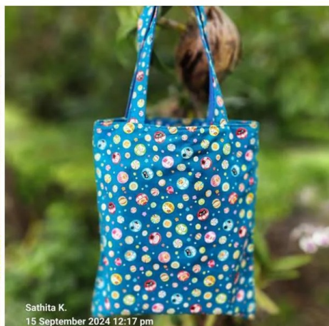
Sathita K. 15 September 2024 12:17 pm